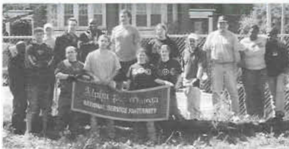
APO Brothers from Alumni Associations and Chapters in Philadelphia, Pennsylvania.