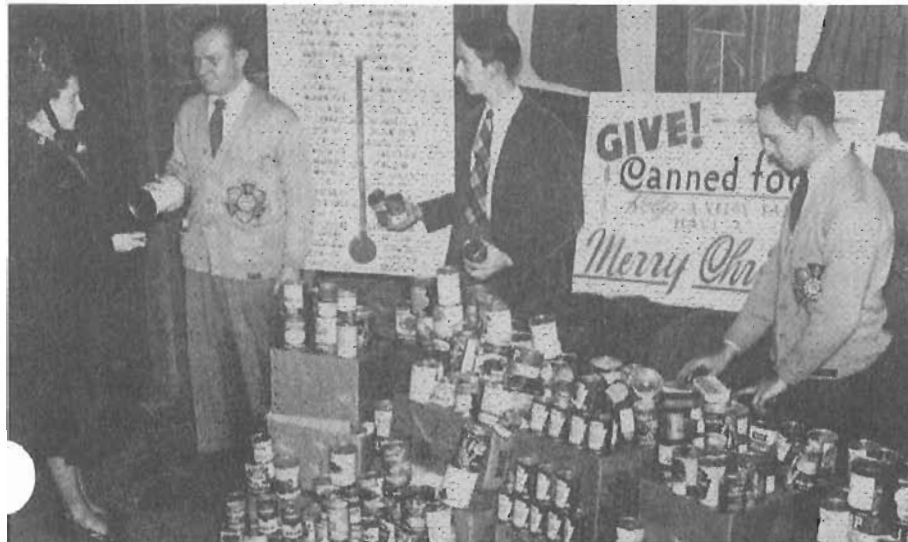
1950 Service at Thanksgiving and Christmas is effectively carried out by APO on many campuses. Pictured are officers of the Epsilon Phi Chapter, Youngstown State University, Youngstown, Ohio, shown giving about 1,500 can goods to the Salvation Army.

For over 70 years Alpha Phi Omega has been going strong. Here are just a few of the many reasons why.