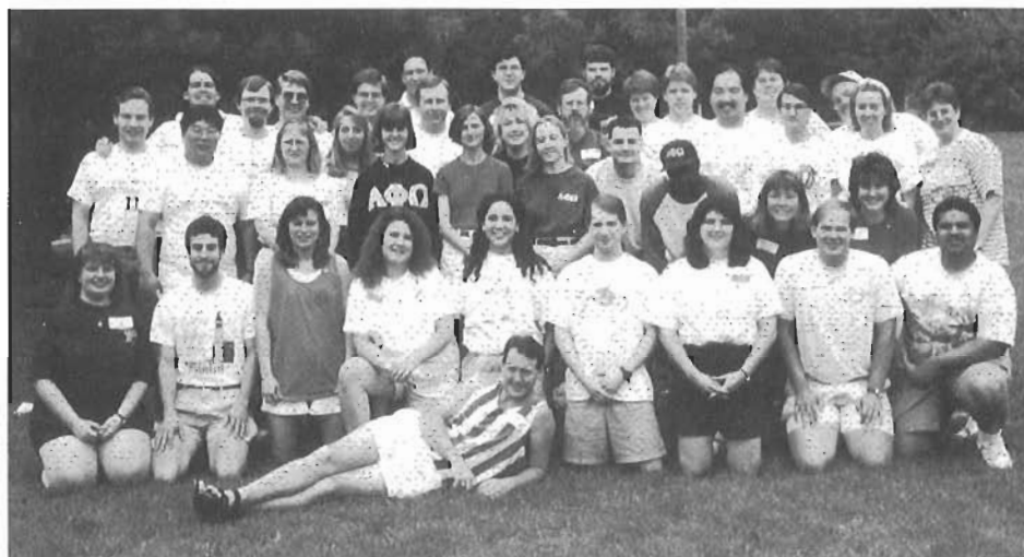
Sectional chairs and staff members from across the nation benefited from the 1996 Sectional Resource Weekend.

Preparations for the 1997 SRW are already under way. Send your